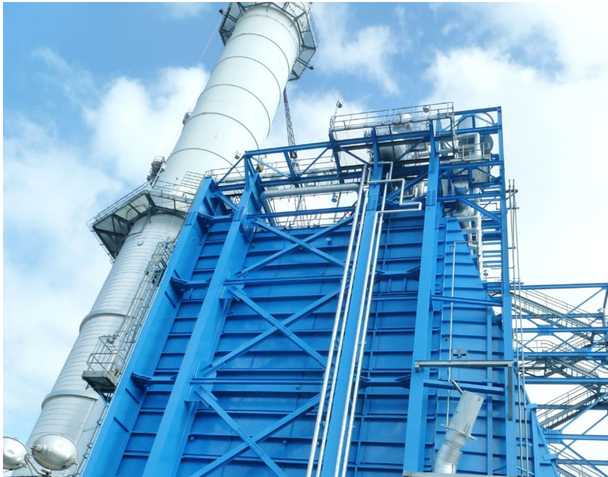
DrumPlus HRSG at El Segundo Power Plant, California, USA

NEM Fast Start solutions allow unrestricted gas turbine ramp-up which results in remarkable flexibility, reduced start-up costs, quick delivery to the grid and significantly lower CO and NO x emissions during start-up.